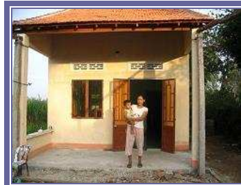
Two of the eight houses destroyed by the storm. We were able to rebuild all of them with your support